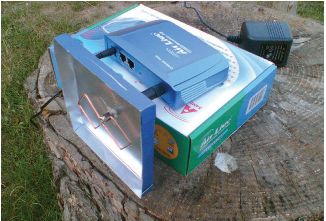
Testing of the local antenna after construction.

in the communities where the community network operates.