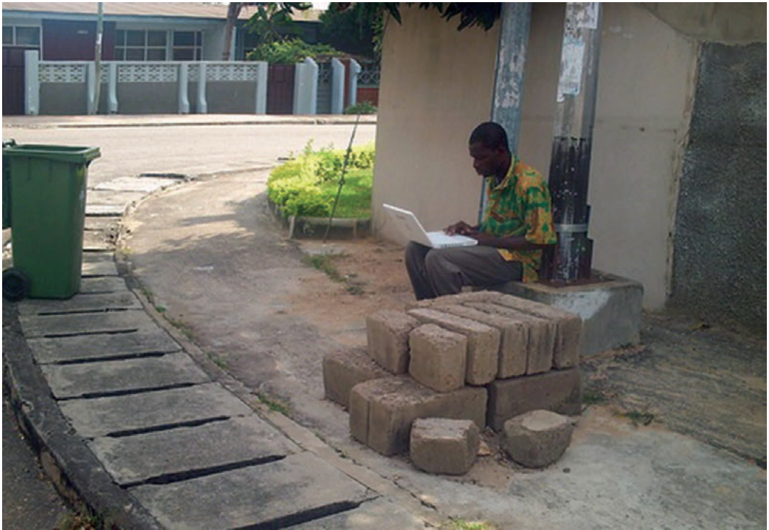
Testing of the internet on the street after installation.

community resource centre) in Akwapim in response to the local community's requests for internet connectivity to help them break their isolation and also connect their children to the digital revolution.